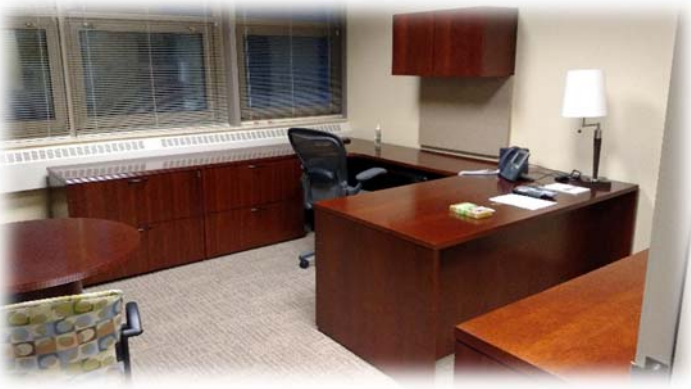
"Senior Office Partner" Workspace