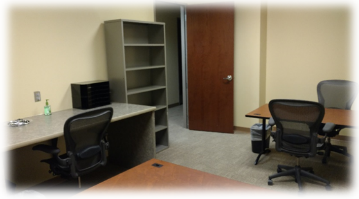
Associate Designated Work Room Area