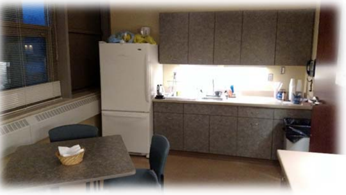
Furnished Break Room Area