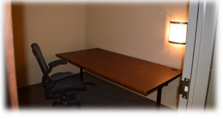
"Junior Office Partner" Workspace