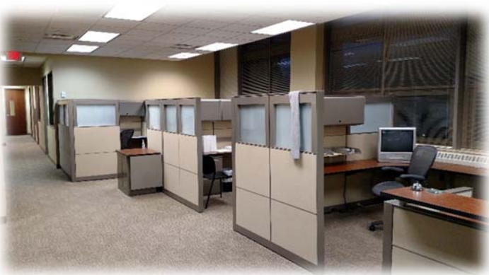
"Associate" Cubicle Area Entering From Atrium